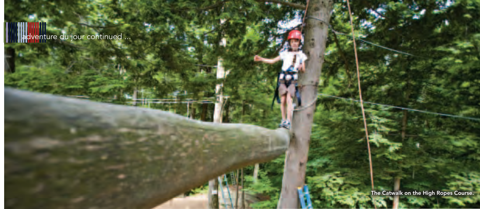
adventure du jour continued ...

Monday - Thursday, 9 am - 4 pm, includes guides, lunch and transportation. 4-day program, regular price $99 per person per day, including guides, equipment, lunch and transportation. FamilyFest Package guests take 25% OFF.