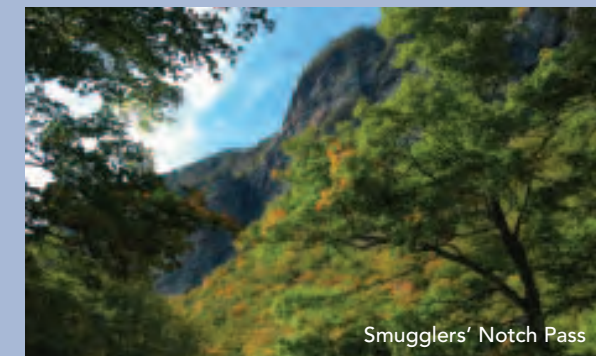
Smugglers' Notch Pass